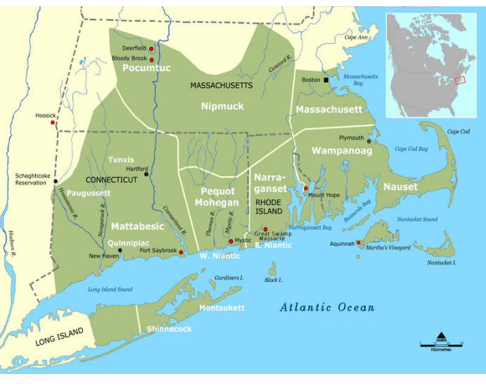
The Wampanoag Confederacy

After fleeing religious persecution in England, and first settling in Leiden, The Netherlands, where thev discovered that they did not care for the Dutch culture, the Pilgrims set sail for America in the hope that they could freely practice their Puritan beliefs. As you all know, they landed at Plymouth in the Patuxet region on the eastern shore of present-day Massachusetts. Patuxet was the homeland of the Wampanoag Confederacy. Wampanoag means "People of the First Light," which makes sense since they would be the first to see the sun rise over the Atlantic Ocean. The Confederacy was led by Chief Massasoit, head of the Pokanoket tribe.