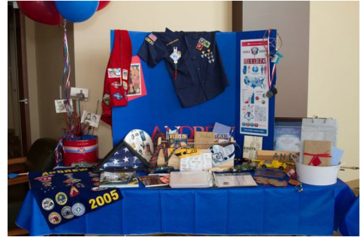
Create an eye-catching display with interactive features, and knowledgeable volunteers !